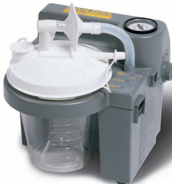
7305P-U with 800ml disposable bottle