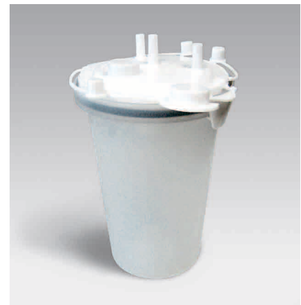
1200 ml re-usable collection bottle